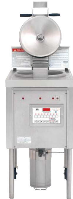
LP46 COLLECTRAMATIC® HIGH EFFICIENCY FRYER 8-Channel Programmable Control

Built to comply with applicable standards for manufacturers. Included are UL, C-UL, UL Sanitation, DEMKO, CE, and MEA.